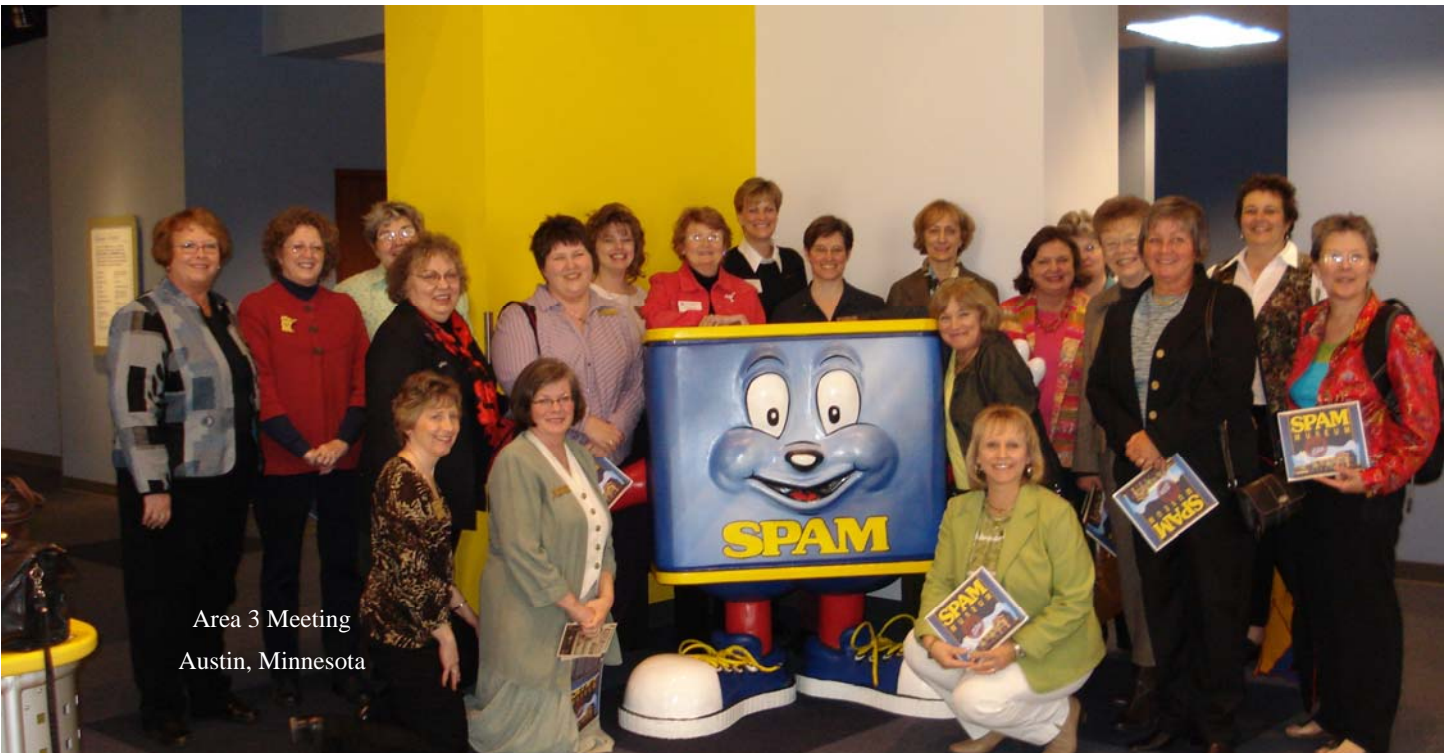
Area 3 Meeting Austin, Minnesota