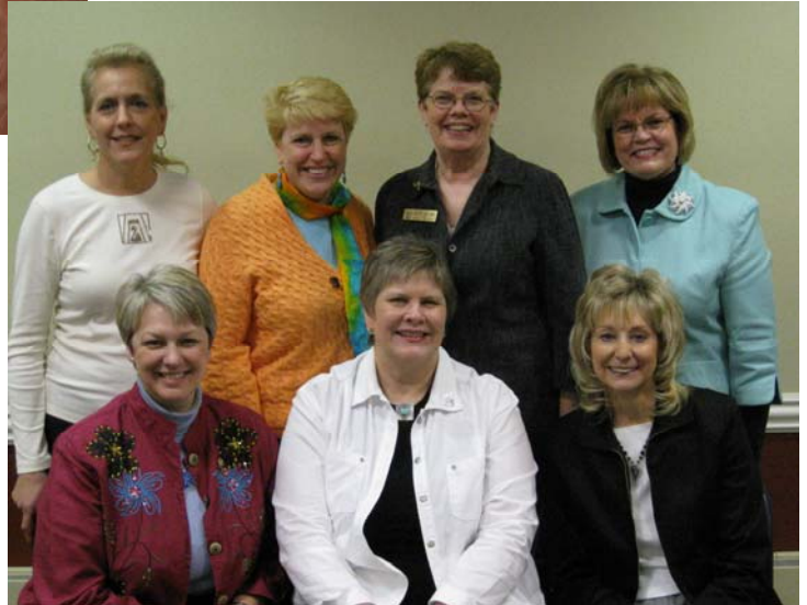
Area 2 Meeting Cape Girardeau, MO