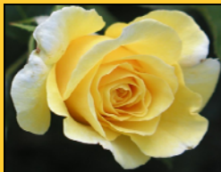
District 7 ZONTA Yellow Rose Club