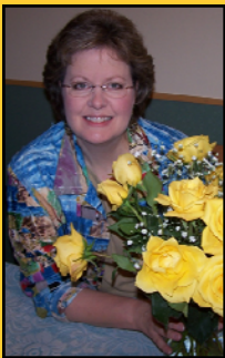
Barb Jirges Lt. Governor