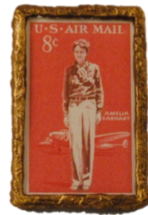
Limited edition Stamp pins $25