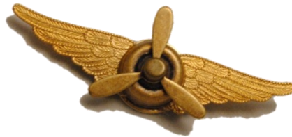
D7 "Steampunk" Pin $20