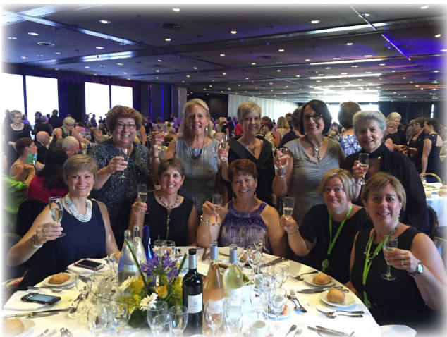
Members of Zonta District 7 at the closing banquet of the Zonta International Convention in Nice.