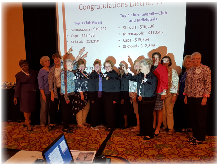
Members of the St. Louis Club in front of the slide displaying District 7 giving at District Seminar.

Next biennium we would like to see every club donate to the Zonta International Foundation so we can have 100% participation as a District.