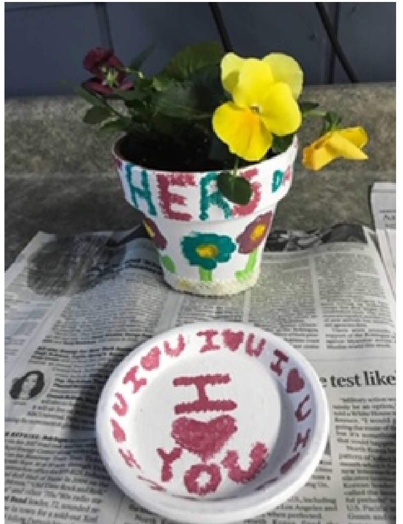
Flower pots decorated with glitter, markers, etc.