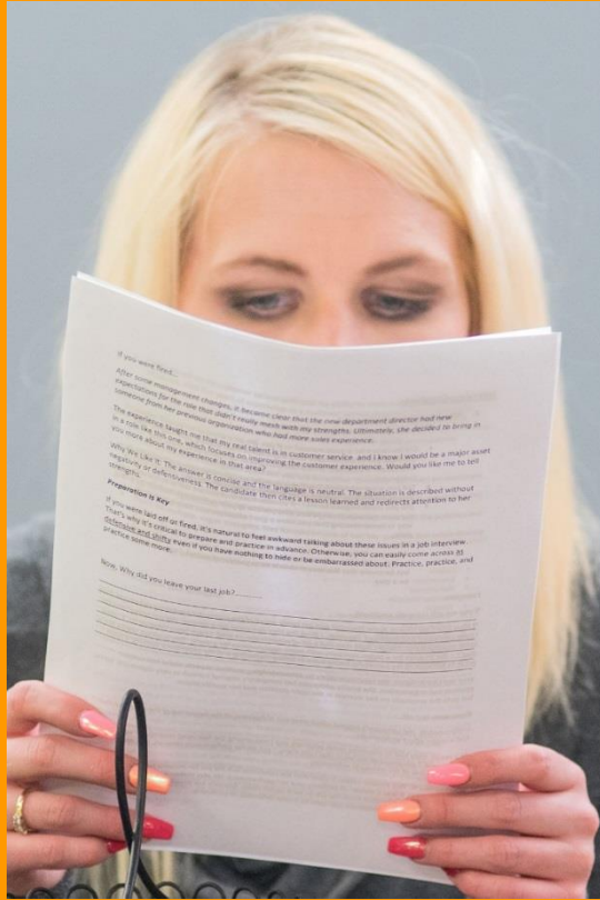
Next Steps participant looks over a sheet with information for job interviews.