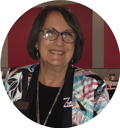
At the Mankato Fashion Show