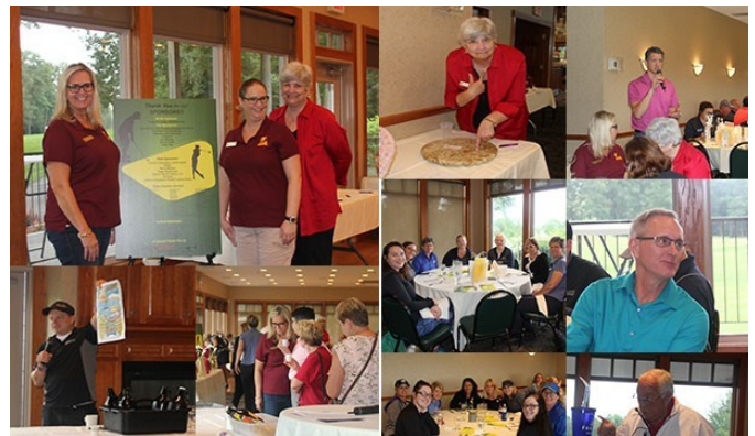
ZONTA CLUB OF ST. CLOUD DIAMONDS IN THE ROUGH GOLF 2018