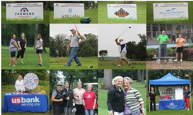
ZONTA CLUB OF ST. CLOUD DIAMONDS IN THE ROUGH GOLF 2018

It is a day of fun designed to support St. Cloud Zonta Club’s projects for the advancement and empowerment of women.